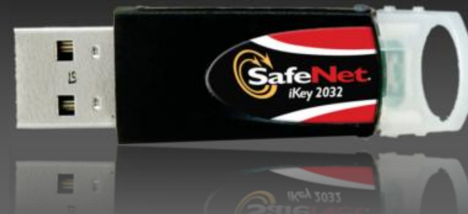
SafeNET iKey™ 2032 USB Cryptographic security comes as standard for all PersonalSign and PersonalSign professional solutions – Portable/Flexible/Reliable

Enterprise PKI Lite (from Q2 2009) for includes options for an Enterprise to manage the full life-cycle of Digital IDs issued under their organization name. i.e. Individual signing USB tokens or central-based credentials for either role-based signings or server held individual Digital IDs. Distributed implementations involve providing organization administrators (acting as the organization registration authority) a bulk shipment of Safenet USB tokens which work in conjunction with Acrobat Standard/Professional/3D. Centralized, server-based implementations work with SafeNet hardware security modules (optionally sold) that are highly integrated with Adobe’s LiveCycle Enterprise Server suite. The net result is a highly automated solution with robust signing functionality.